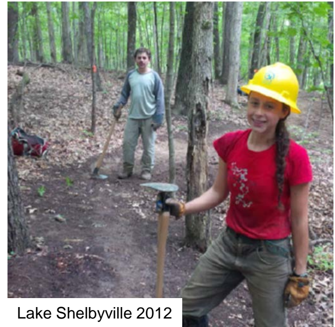
Lake Shelbyville 2012