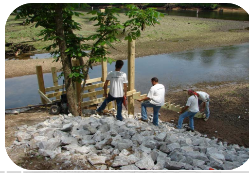
Center Hill Lake