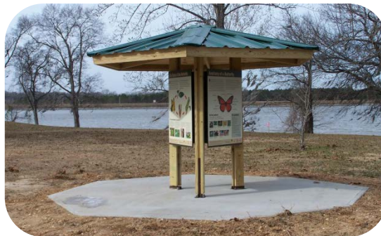
William Dannelly Reservoir