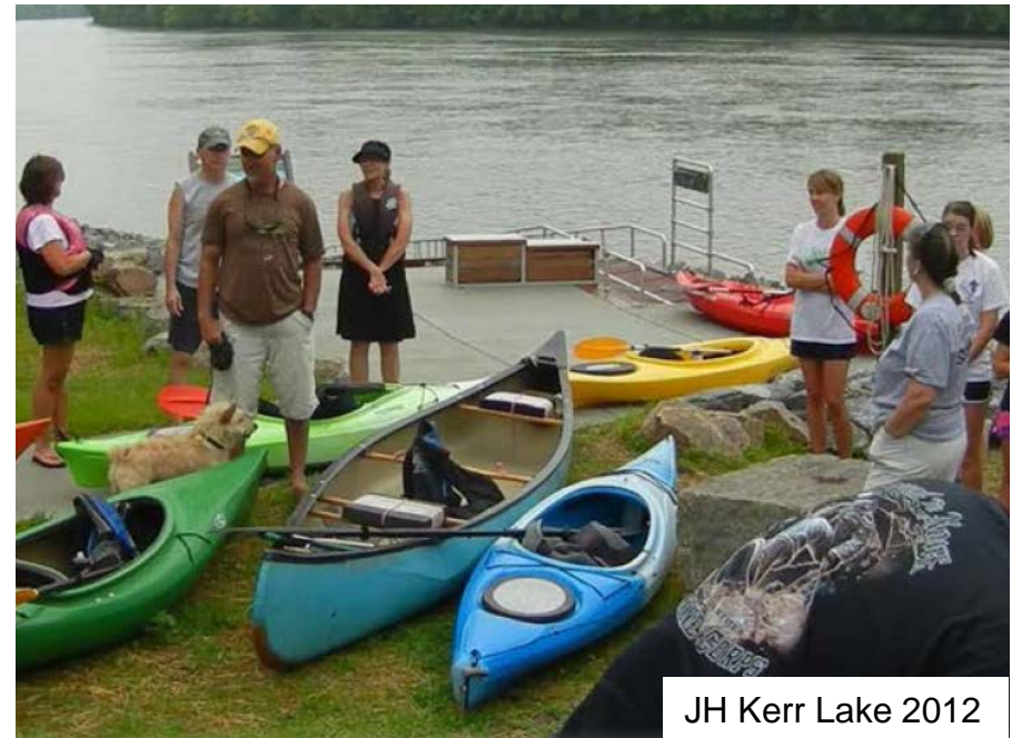
JH Kerr Lake 2012